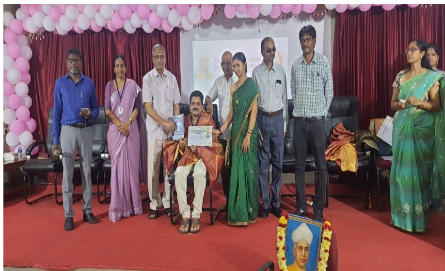
felicitating teachers on the occasion of Teacher's Day.