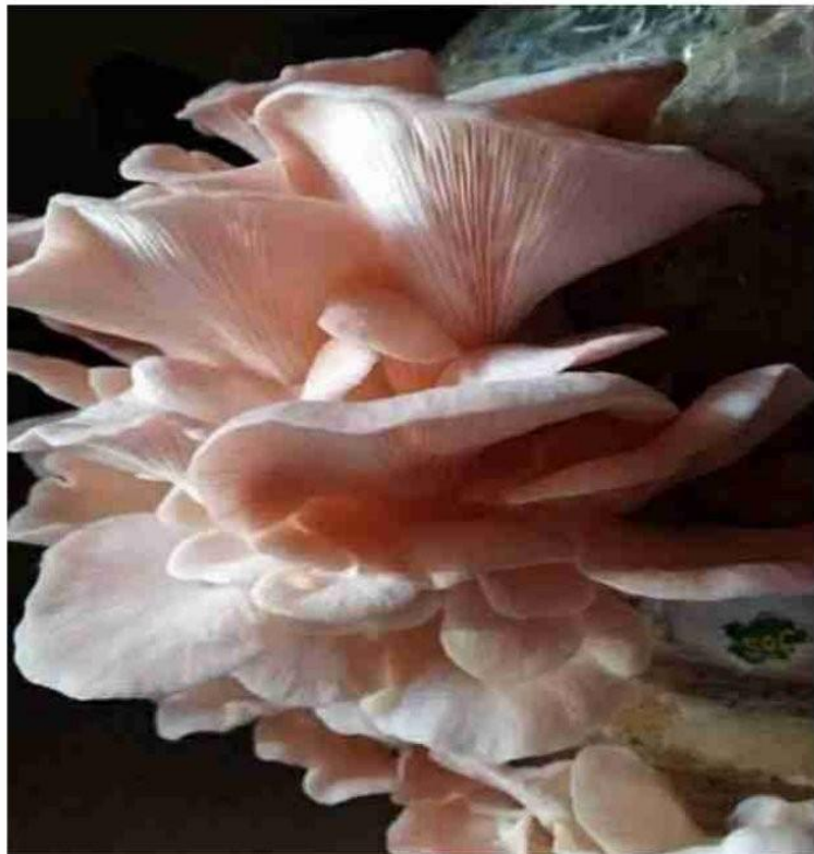
DAY - 6