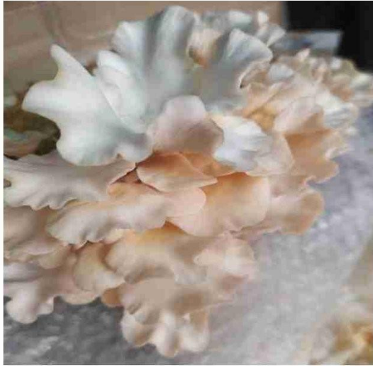
DAY - 5