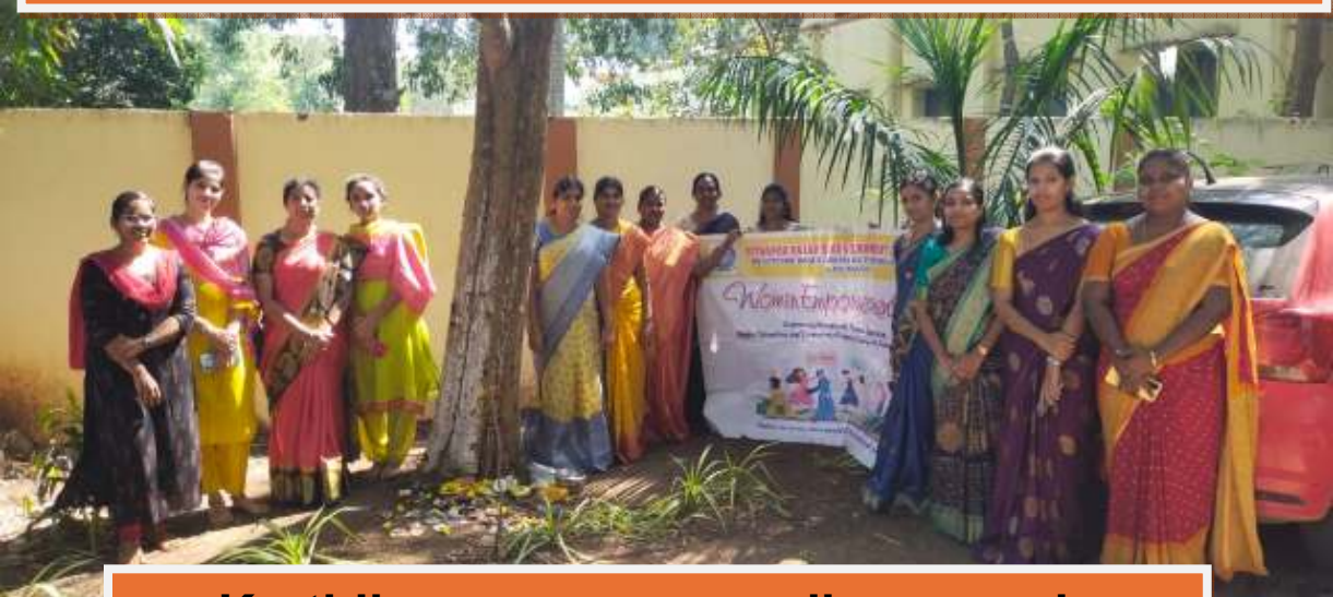
Karthika vana samaaradhana pooja