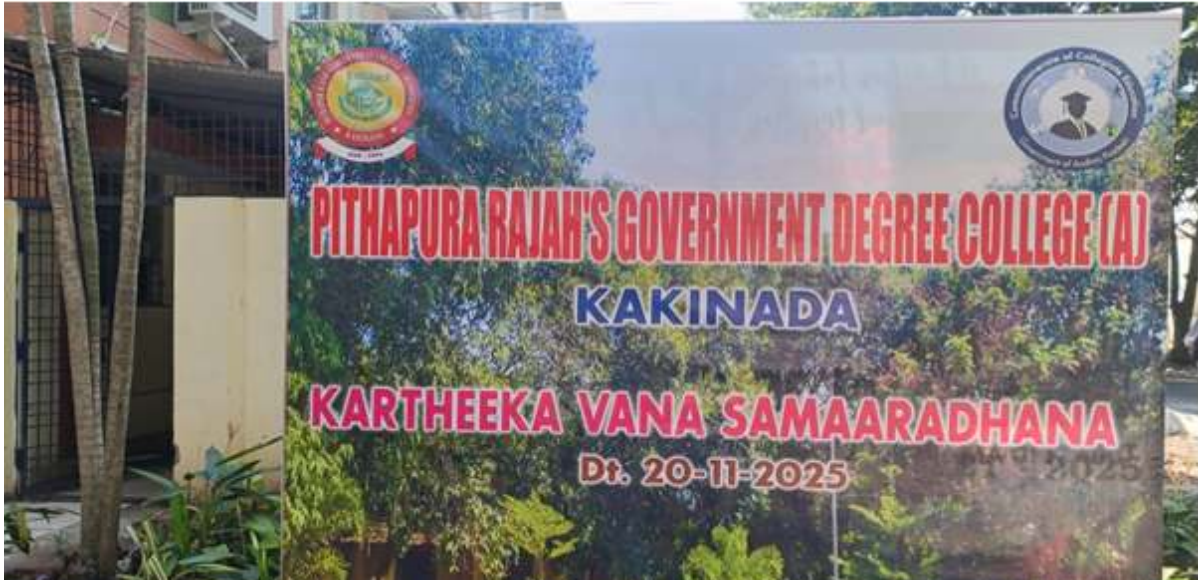
Activity Conducted by WEC in collaboration with NSS