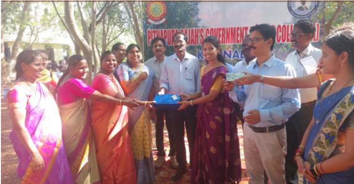
Karthika vana Samaaradhana Bojanalu