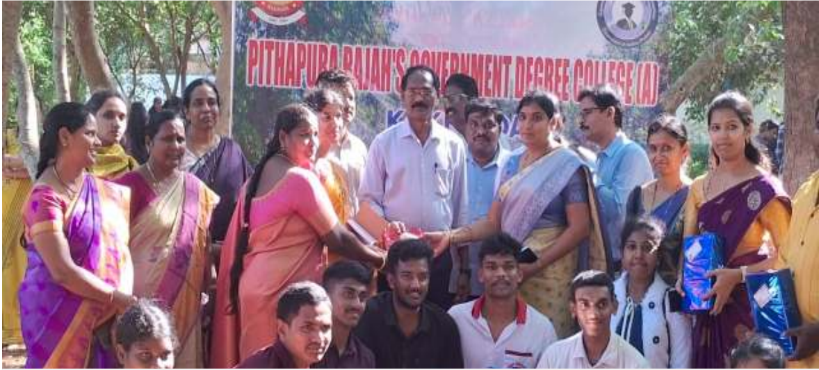
Prize Distribution to Winners of Staff & Students